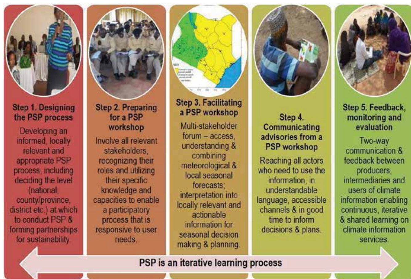
Figure 1: Five major steps of the PSP process.