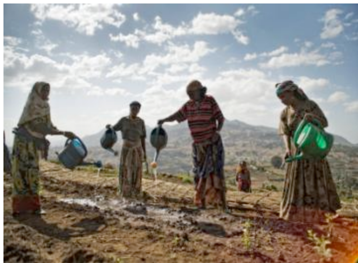
Women watering land in Gemechis, Ethiopia