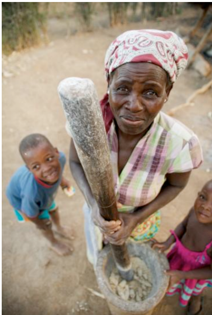
Women pounding millet, Guija district, Mozambique