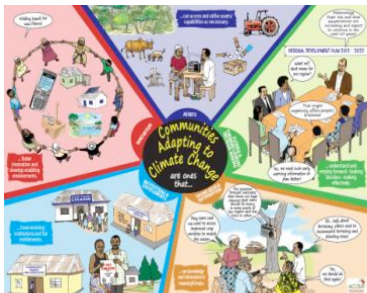
Local Adaptive Capacity Framework Poster

ACCRA's contribution is shaped by an integrated, three-track approach to achieving change, made up of three nationally-led, designed and delivered operational components: research, advocacy and capacity building . ACCRA's approach is to support pro-poor and participatory planning processes, enabling communities better to exercise their agency through access to information and to national policy frameworks. ACCRA also uses capacity building to explore and develop the ways in which people think about adaptation, disaster risk reduction and working with one another. It seeks to support national ownership and collaborative solutions.