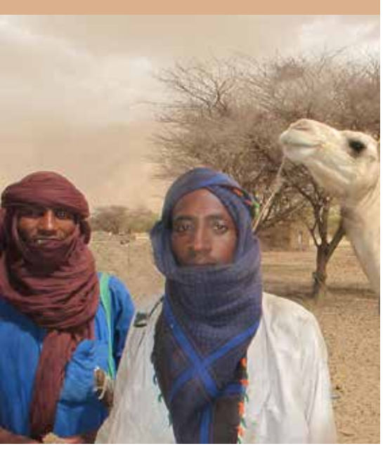
Pastoralists in Niger

Joto Afrika is a series of printed briefings and online resources about adapting to climate change in sub-Saharan Africa. The series help people understand the issues, constraints and opportunities that poor people face in adapting to climate change and escaping poverty.