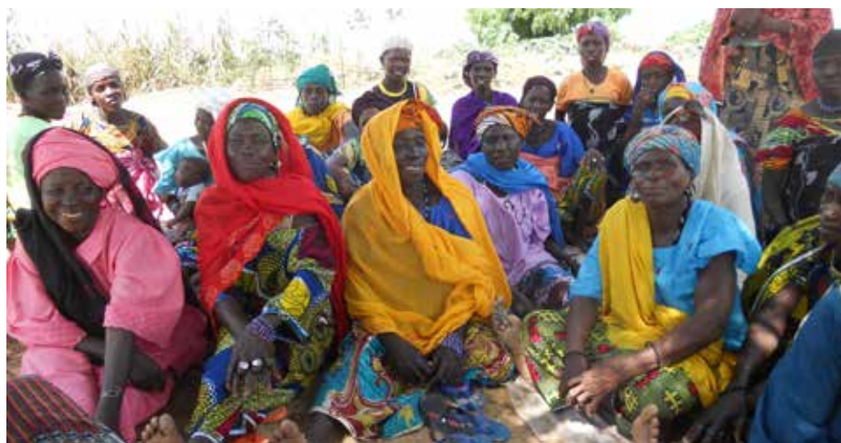
Women discussing the value of community rain gauges in Dakoro, Niger