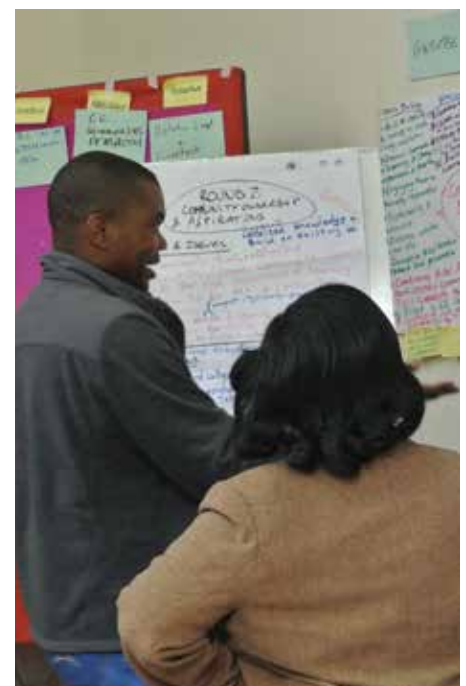
Participants discussing resilience during ESA event