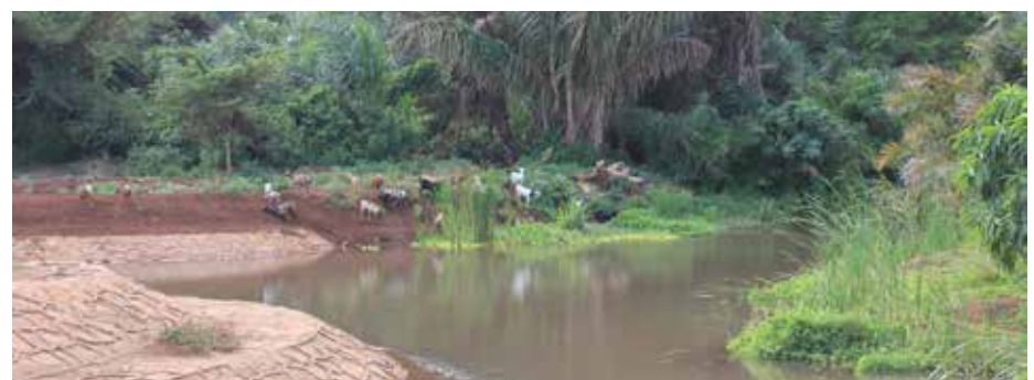
The Miwaleni Springs in Moshi Rural District, Tanzania

Potentials of and Threats to Traditional Institutions for Community-Based Biodiversity Management in Dryland Areas of Lower Moshi, Tanzania. http://bit.ly/16pvBTj