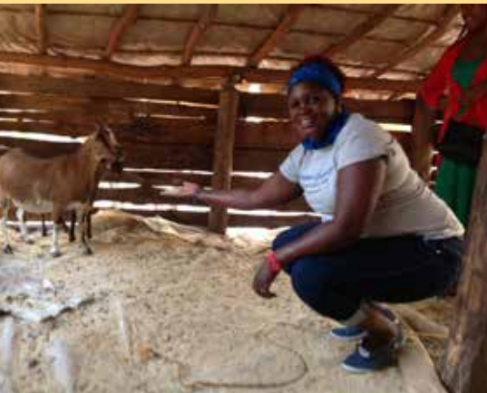
Dairy goats farming in Zambia

Joto Afrika is a series of printed briefings and online resources about adapting to climate change in sub-Saharan Africa. The series help people understand the issues, constraints and opportunities that poor people face in adapting to climate change and escaping poverty.